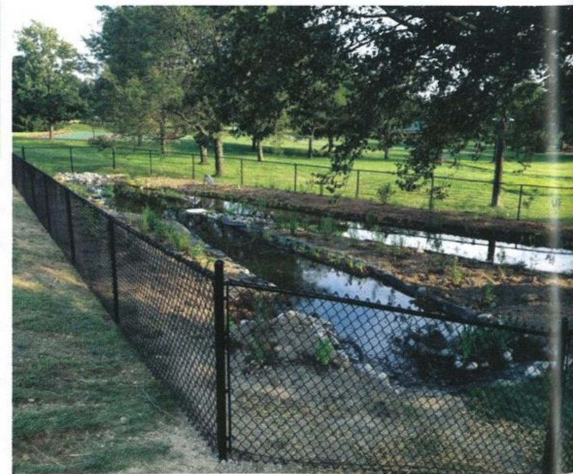
The Sierra Club and Upper Macungie Township, Lehigh County, transformed a soggy spot in a local park into a wetland. The group diverted runoff to a newly lined pond and then planted native grasses and shrubs to restore natural habitat that had been lost to development. The township erected a fence to protect the wetland and park visitors.