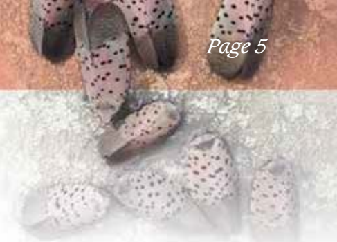
(Above) Adult Spotted Lanternflies on a Tree-of-heaven.