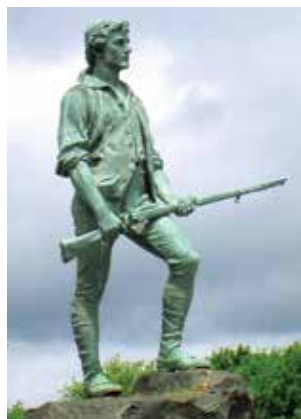
Above: The Minuteman statue in Lexington Battle Green, Mass. The idea of CERT is the same as the Minutemen during the Revolutionary Era.

The knowledge you and your kids gain could be a real lifesaver! DON'T MISS IT!