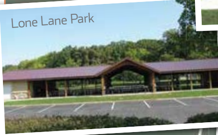
Lone Lane Park