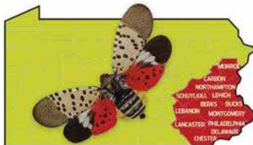
« Spotted Lanternfly quarantine area shown in red (as of June 2018).