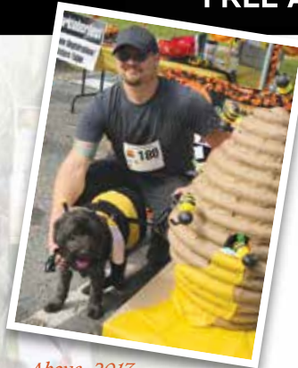
Above: 2017 Pet Costume 1st Place Winner

All dogs must be on a leash and kept under control by owners at all times.