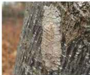
« Eggs laid on a tree. Newly laid egg masses have a gray putty-like covering, which can become dry and cracked over time. Old egg masses appear as about 1-inch long, 4-7 columns of seed-like eggs.