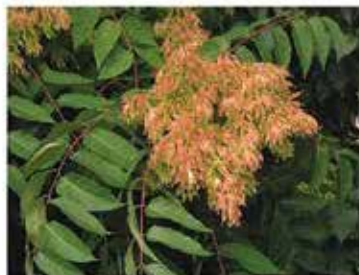
« Spotted Lanternfly is particularly attracted to Tree-of-heaven ( Ailanthus altissima ), another invasive species proliferating in our region.